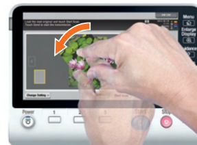
Rotate images on the Preview screen