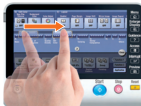
Flick the Copy screen

The bizhub C754e/C654e implement the new multi-touch user interface which realises the same intuitive operation as mobile devices. Smartphone-like tap, flick and pinch make operations easier and more comfortable.