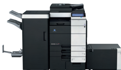
Model shown is C754e with options.

Recycled materials are effectively employed for the outer surfaces such as recycled PC/PET developed by Konica Minolta using advanced chemical processing technology, recycled PC/ABS and bioplastics to help reduce environmental impact.